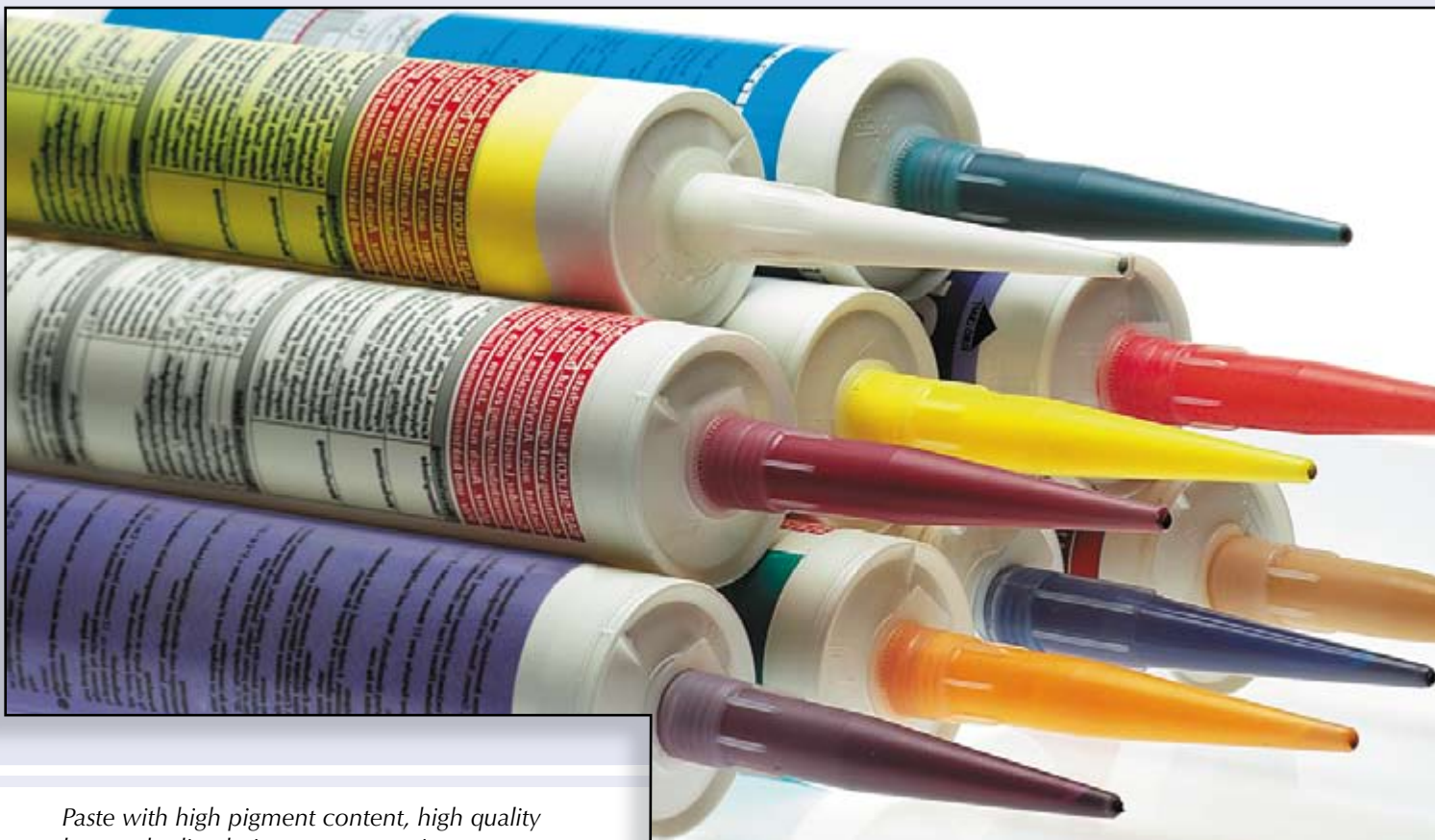
Paste with high pigment content, high quality by standardized pigment preparations