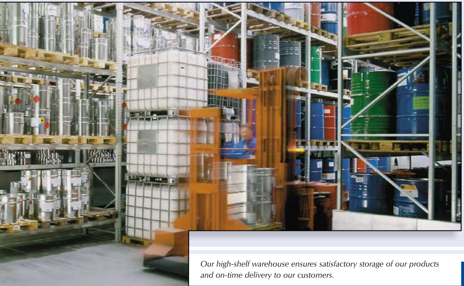
Our high-shelf warehouse ensures satisfactory storage of our products and on-time delivery to our customers.