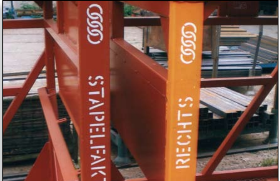
Excellent know-how in corrosion protection

Special applications of these high-quality corrosion protection systems are found in steel-, plant-, machine and container construction, as well as in all fields of automotive engineering. Processing is possible via injection (normal air-, airless-, ESTA-, hot injection methods etc.) or by dipping, rolling or coating.